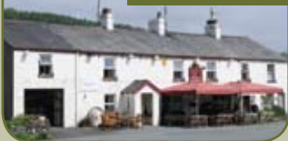
The Wilson's Arms